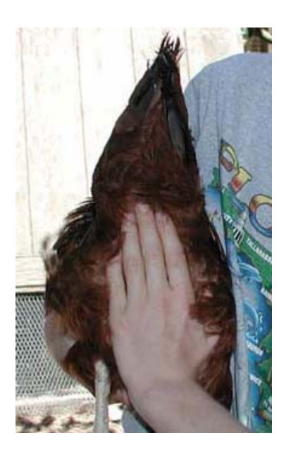
Figure 5 . Pelvic spread in a hen in production (four fingers in width).