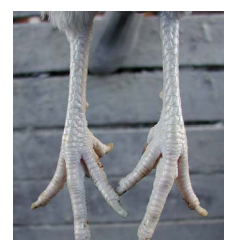
Figure 3 . Shanks and toes of a hen that has been in egg production greater than 20 weeks. Note the extensive loss of pigment.