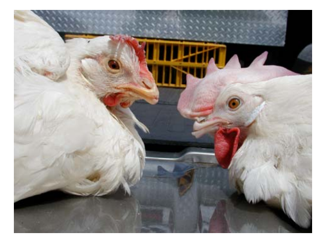
Figure 1 . Non-layer (left) vs. hen in production (right). Compare eye ring and beak color, and comb and wattle size.