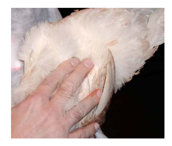
Figure 4. Pelvic spread in a non-layer (two fingers in width).