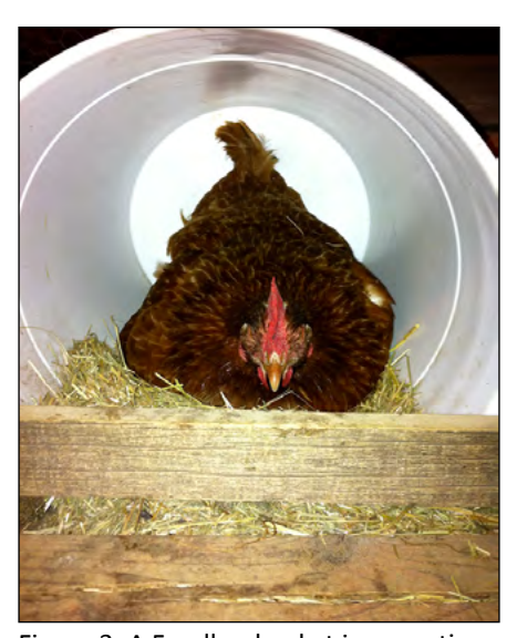
Figure 3. A 5-gallon bucket is a creative alternative to the traditional wooden nesting box.

For more information, please see the OSU Extension Service Catalog at: <a href="http://extension.oregonstate.edu/catalog/">http://extension.oregonstate.edu/catalog/</a>