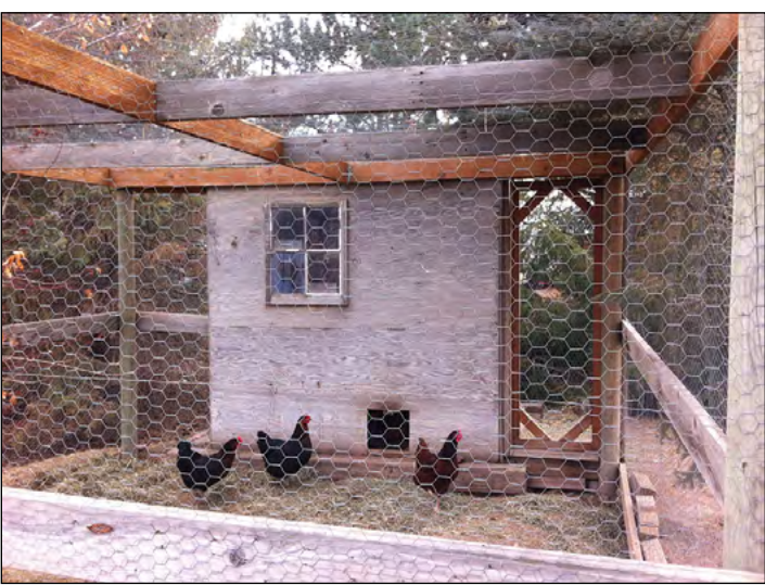
Figure 1. Chicken coop with outdoor enclosed run